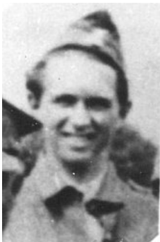
At military training camp - June 1939